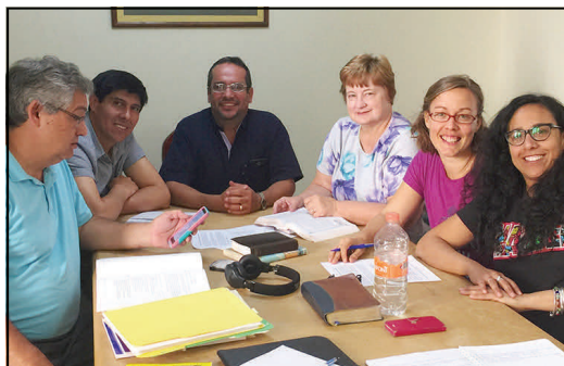
TEAMWORK! In this picture (L to R) is 1 USA pastor, 1 Chilean missionary, 1 Mexican pastor, 1 USA National org leader, 1 translator, and 1 Argentine child psychologist.

Now the push is on to train up a core of trauma care workers for future teams. To this end we are hosting a Trauma Care Workshop Jan. 13-15 in Columbus, Ohio.